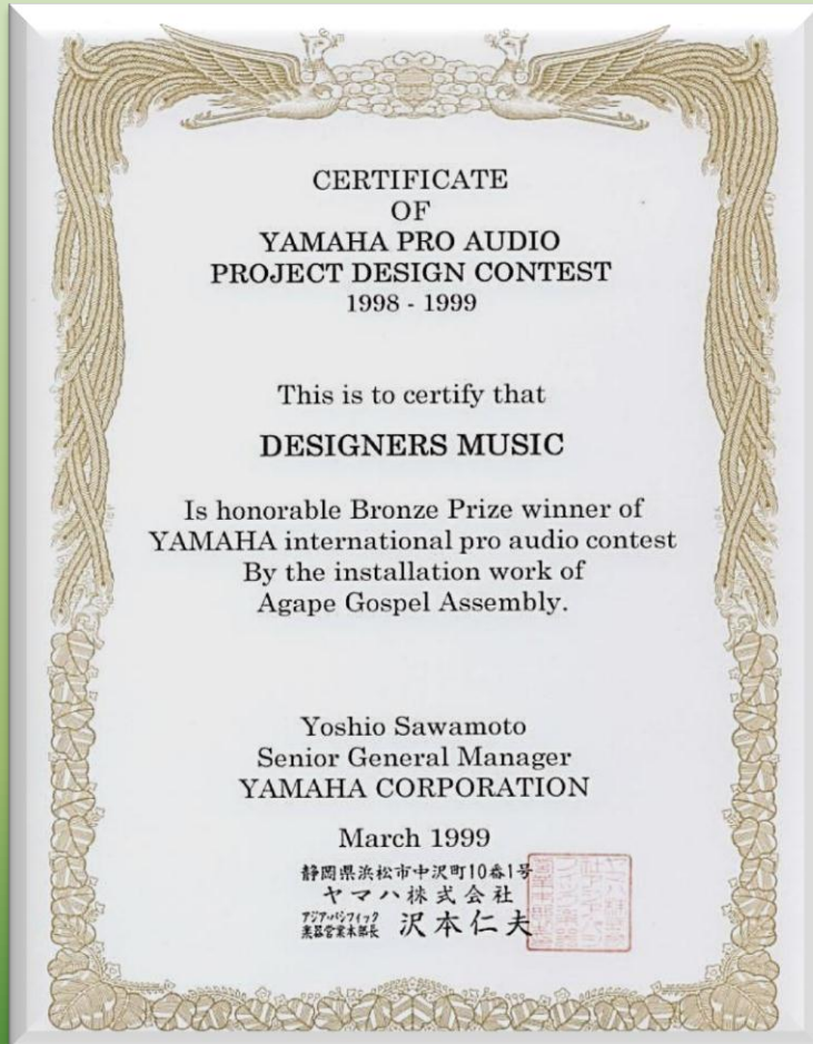
Yamaha International Pro Audio Contest Asia 98/99