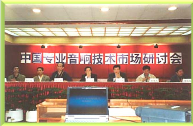
Speaker for Audio Seminar organized by CETS Society China