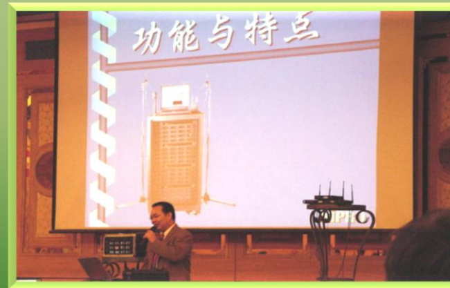
Speaker for Mipro wireless mic system Seminar/ Launching Beijing 2005