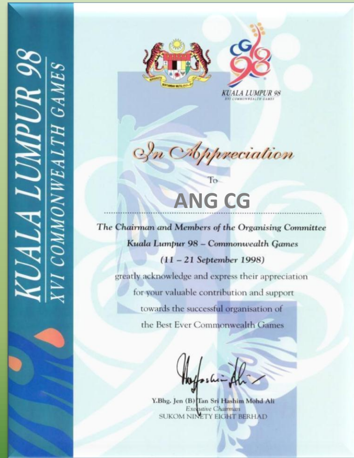
XVI Commonwealth Game 1998, Malaysia